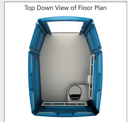
Top Down View of Floor Plan