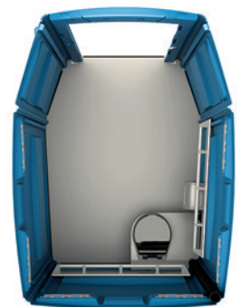
Top Down View of Floor Plan