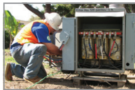
Transformers & Distribution Services