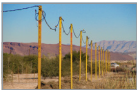
Standard & Black Diamond Poles

With an assortment of power options including single and three-phase systems, high-voltage upgrades, telephone wiring, as well as stringer, sub poles, stand-up cabinets, spider boxes, cord and more, call the power professionals at National Construction Rentals today.