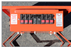
Accessories: Spider Boxes & More